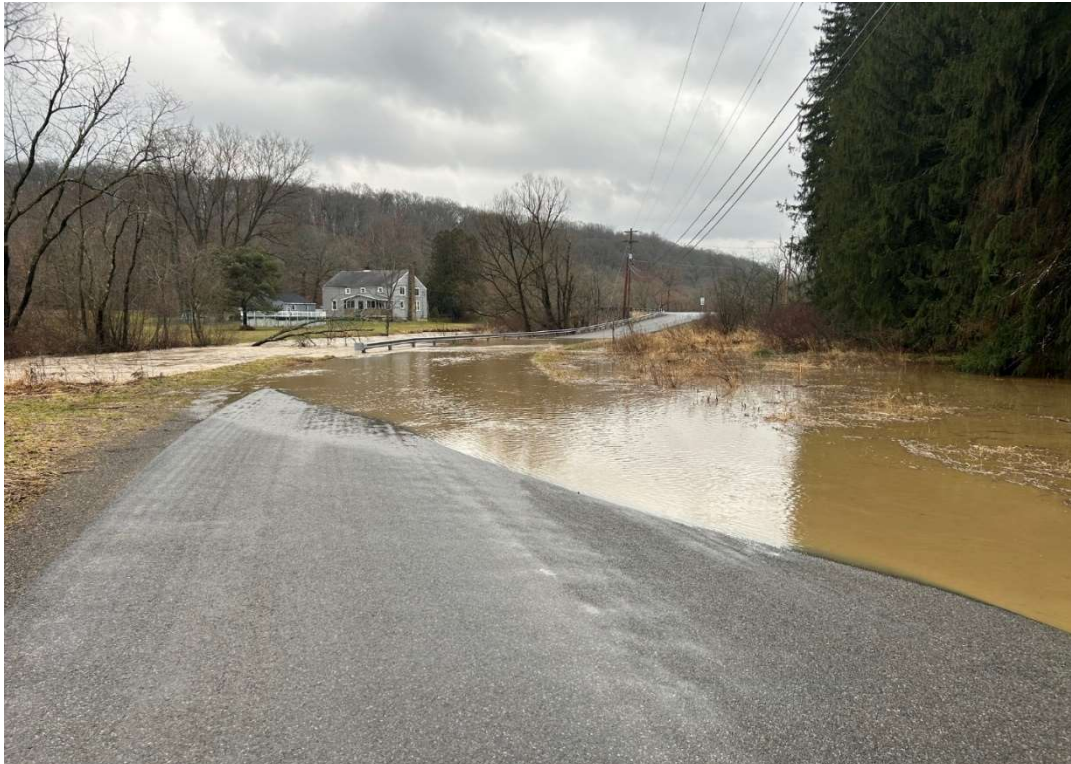
BEFORE CONSTRUCTION: Dodds Road was flooded after heavy rains in February 2024.