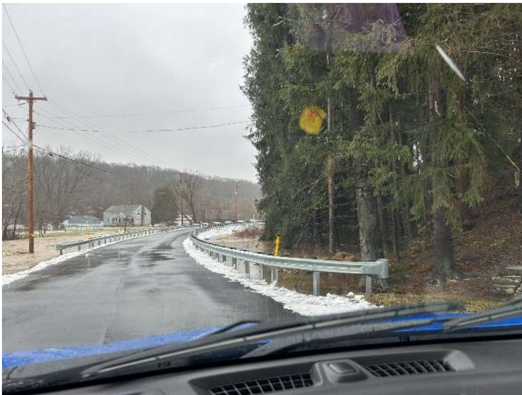
AFTER CONSTRUCTION: The road remained clear after similar rain and melting snow in February 2025.