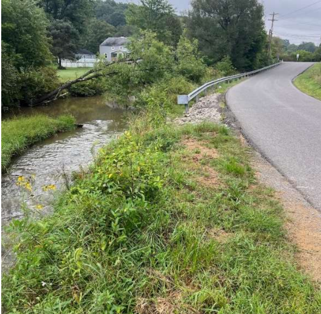
BEFORE CONSTRUCTION: Dodds Road was very close to the creek, and visibility at the intersection with Rockdale Road was reduced due to the steep slope of the roadway.