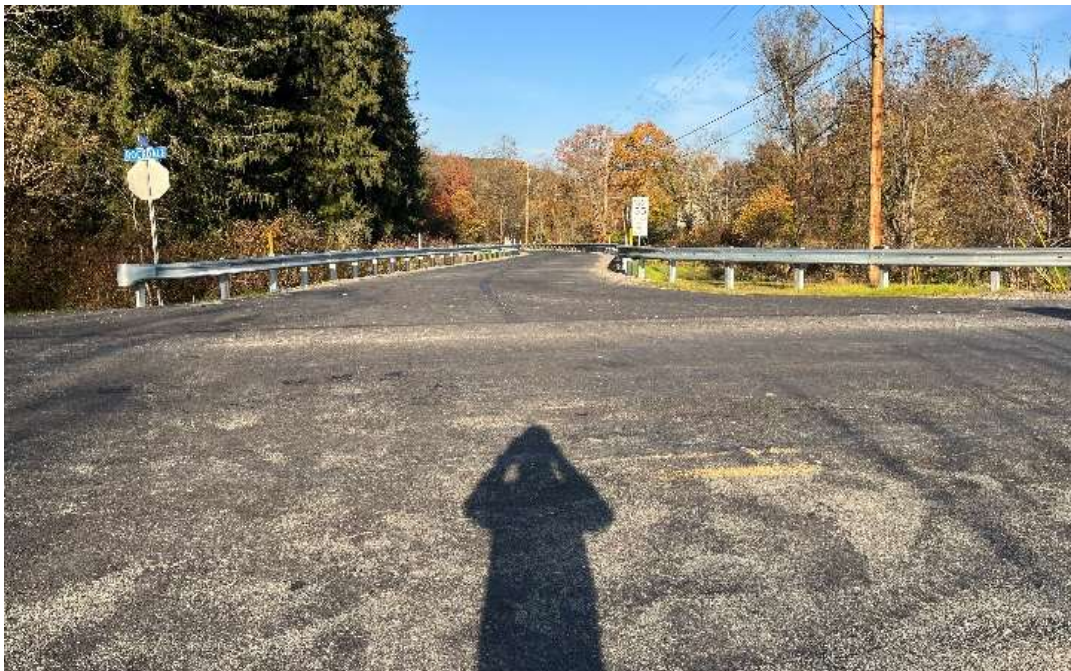
Improved visibility and turning radii at intersection of Dodds Road and Rockdale Road